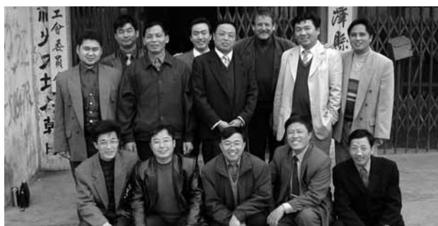
Provincial Project Office Staff of our Afforestation Project in Jiangxi Province