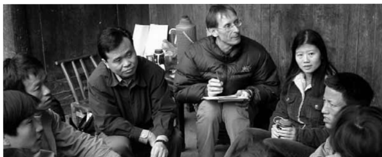
Interviewing farmers in Hunan