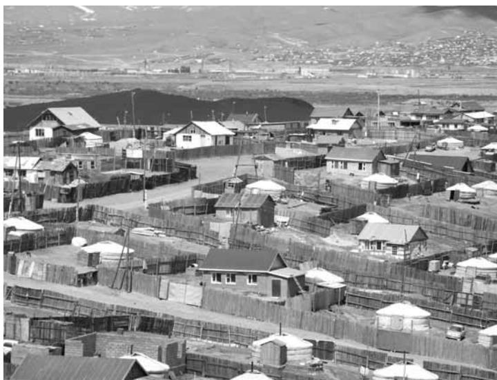
Ger settlement in the Nisekh Area, Ulaanbaatar

Since its transformation into a democracy Mongolia is experiencing a rapid urbanisation mainly as a result of migration of population from rural to urban areas. The population of Ulaanbaatar has more than doubled during the past 10 years and amounts currently of about 1.1 million inhabitants according to unofficial estimations. Most of the migrants have settled in informal settlements (ger areas) consisting mainly of felt tents without piped water, inadequate drainage and flood protection and only very poor sanitation facilities (pit latrines).