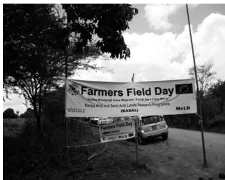
Indigenous Poultry: Kathonzweni Farmers' Field-Day Banner

From March to April 2010 GITEC took part in a mid-term evaluation mission for a special research project called KASAL, a research programme for the arid and semi-arid districts (ASAL) of Kenya funded under the 9 th EDF (2006-2010) with 7,9 million €. The purpose of the