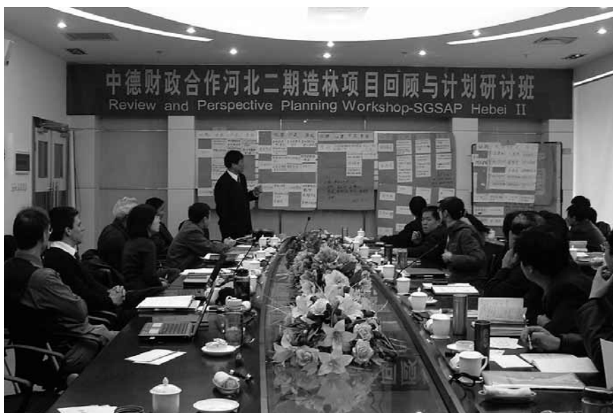
Mid Term Review in our Sino-German Smallholder Afforestation Project in Hebei

Once again China and Germany moved closer together in exchanging ideas on forestry development. Within the scope of the German-Chinese dialogue, a three-day event on Sustainable Forest Management (SFM) was organized under the leadership of K f W - G e r m a n Development Bank in Berlin. The event started on May 18 th with a plenary session day at KfW Berlin, followed by two field demonstration days in the state of Brandenburg. The event was visited by high-ranking German and Chinese participants at Minister and State Secretary level as well as decision makers from the German and Chinese forestry sector. The event provided the possibility to discuss and to exchange ideas on forestry subjects of global significance, such as sustainable, multifunctional forest management, CO 2 reduction, illegal logging, and forestry reforms in China. Other fields such as