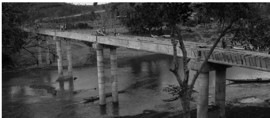
Bridge in Project Area

The Rural Infrastructure Programme (RIP), funded under Lao-German bilateral FINCOOP (KfW), is entering Phase III, transferring the services of Phases I and II from Northern Provinces Bokeo, Luang Namtha and Oudomxay to Sayabouri and Attapeu, in the North-Western and Southern parts of Lao PDR. Subsequent to successful completion of the preceding Rural Roads Programme – Bokeo, as well as the first and second phases of RIP, GITEC Consult was awarded the contract for the implementation of RIP III after competitive bidding. Responsible for contract implementation is the Ministry of Public Works and Transport, Department of Roads, which has transferred implementing authority to provincial and district levels to the Department of Public Works and Transport (DPWT) and Office of Public Works and Transport (OPWT), in line with the decentralisation initiative of Lao PDR. Close co-operation with local authorities is one of the main features of RIP-Projects fostering efficiency, capacity building and sustainability.